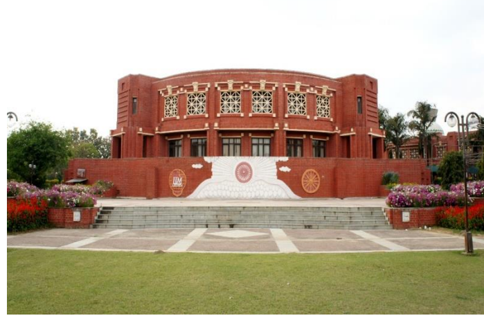
excellence in management education and research, in newer and better ways. For more details, please visit Indian Institute of Management, Lucknow website http://www.iiml.ac.in/

The mission of IIM Lucknow is to help improve management systems with regard to business, industry and public services through pursuit of excellence in management education, research, consultancy and training. The institute undertakes a diverse range of academic activities aimed at creation, dissemination and application of management knowledge and practice. It moulds its students into value driven leaders, managers and global players. The Institute's 185 acre campus, located amidst serene surroundings at Prabandh Nagar, provides an ideal environment for the pursuit of academic